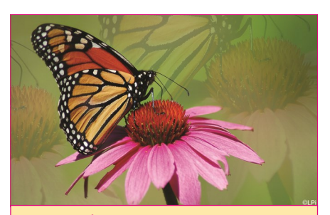
Enjoy the Lazy Days of Summer and the Beauty of Nature

There are some limitations and some of our brokenness with which we may simply have to live. This does not mean that we have to abandon our journey to wholeness and healing. If we have done our inner soul work, we have worked toward and acquired what and who we ultimately need and desire.