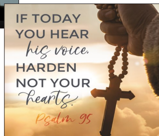
3rd SUNDAY OF LENT